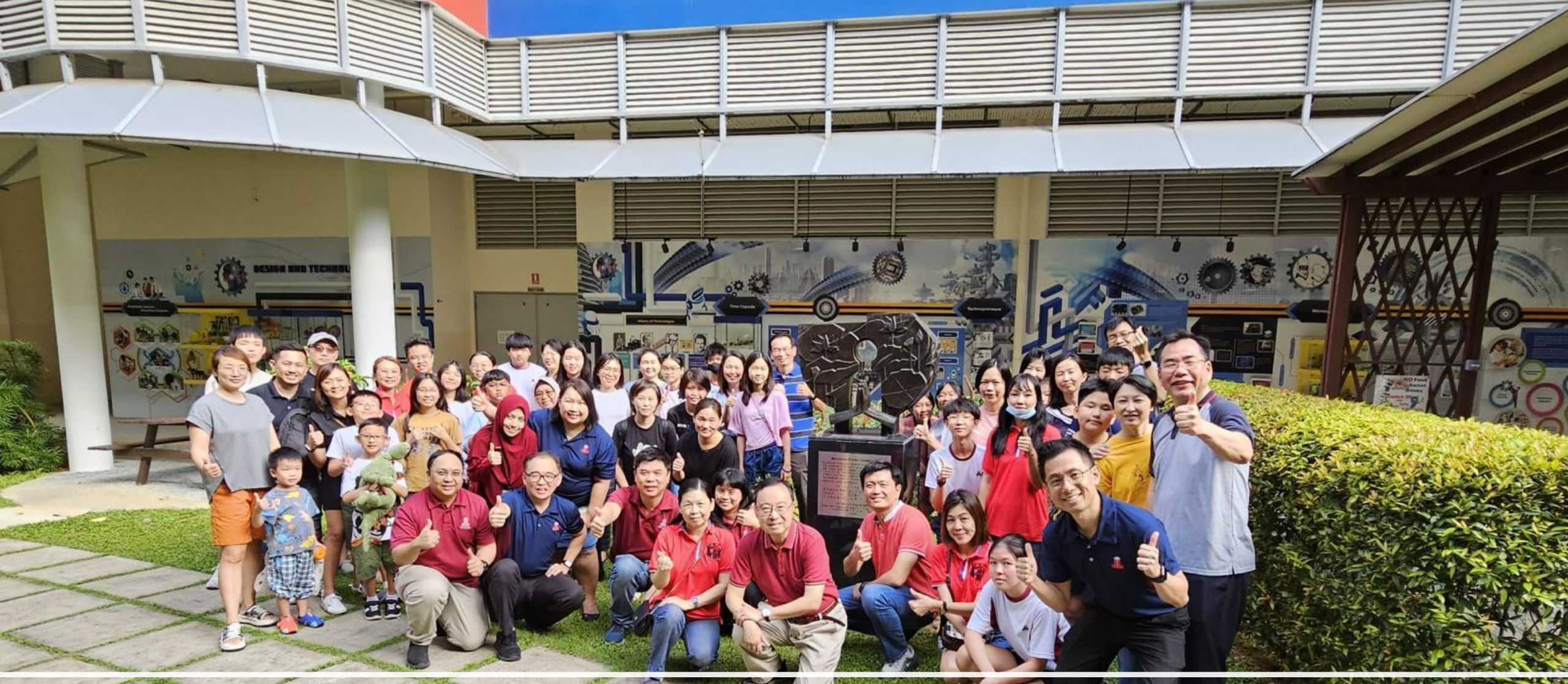
MJR PSG Family